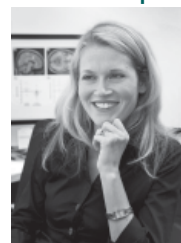
Naomi Eisenberger, PhD

Numerous languages characterize 'social pain,' the feelings resulting from social rejection or loss, with words typically reserved for describing physical pain ("broken hearts," "hurt feelings") and perhaps for good reason. It has been suggested that, in mammalian species, the social attachment system borrowed the computations of the physical pain system in order to prevent the potentially harmful consequences of social separation. In this talk, I will use a combination of behavioral and