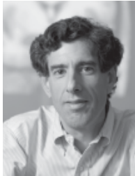
Richard J. Davidson, PhD

Emotions are at the core of human personality, they define each person's uniqueness and they shape resilience and vulnerability to adversity. Perhaps the single most salient characteristic of emotion is the variability across individuals in how each responds to emotional cues and challenges. This variability is termed "affective style." Different parameters of affective style can be objectively measured and are instantiated in different underlying neural circuits. Activation patterns assessed with neuroimaging, particularly those involving interactions between sectors of the prefrontal cortex and subcortical structures implicated in emotion, are related to different parameters of affective style and are consistent over time within individuals. Specific patterns of brain activity are related to vulnerability to particular types of disorders. Moreover, patterns of central brain function are related to peripheral biological systems that play a role in physical health and illness. Despite their consistency over time within individuals, these patterns of neural activity are not immutable to change but rather can be transformed through systematic mental training such as meditation. The literature on neuroplasticity provides a framework for understanding these changes. This latter body of evidence supports the view that happiness, well-being and emotional balance are best regarded as the product of trainable skills.